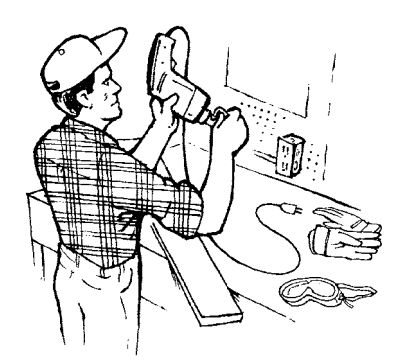
Unplug power tools before changing bits or blades.